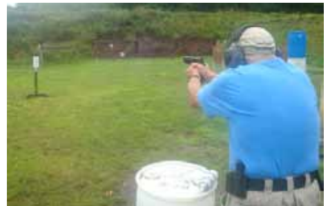
STAGE 4: BILL DRILL ON STEEL Engage steel plate with 6 rounds.