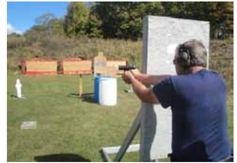
STAGE 4: FOUR TIMES THREE PLUS TWO Activate swinger then engage T-1 thru T-3 with 4 rounds each and the steel until they fall. Total of 14 rounds.