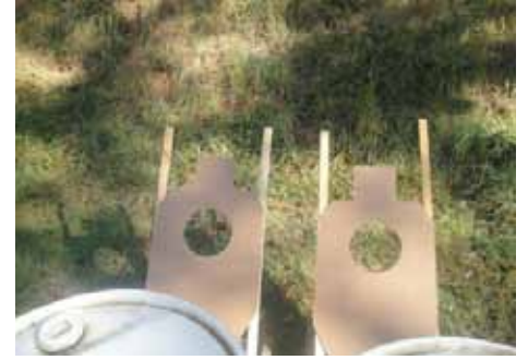
STAGE 6: MAGAZINE TABLE Unloaded gun and all magazines on table. Engage T-1 thru T-6 with 2 rounds each. Total of 12 rounds.