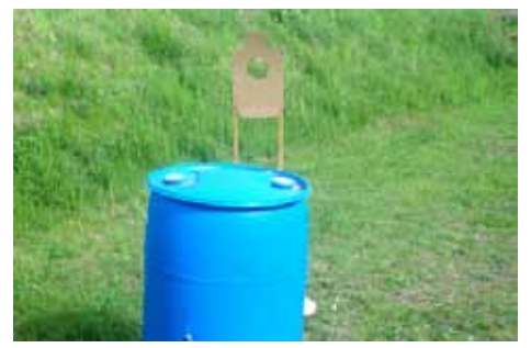
STAGE 4: JUGGLING Caught with an empty gun and part filled mags you engage T-1 with 6 rounds from the 3 available magazines. Total of 6 rounds.