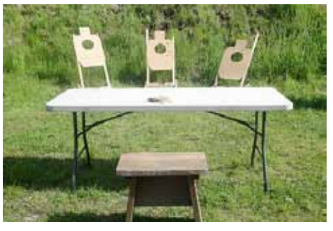
STAGE 5: LIARS AND CHEATS After calling your card partners liars and cheats you have to defend yourself. Engage T-1 thru T-3 with 3 rounds each. Total of 9 rounds.