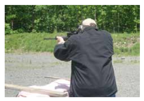
...fires the rifle