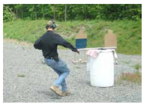
...and finishes with his pistol