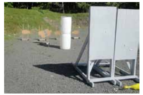
STAGE 3: CHICKEN WALK Coyotes want a taste of your pet chicken. Engage T-1 thru T-4 with 2 rounds from P-1 and then again from P-2. Total 16 rounds.