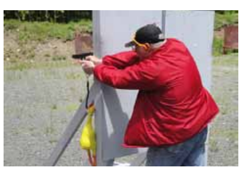
... then defends it from the coyotes