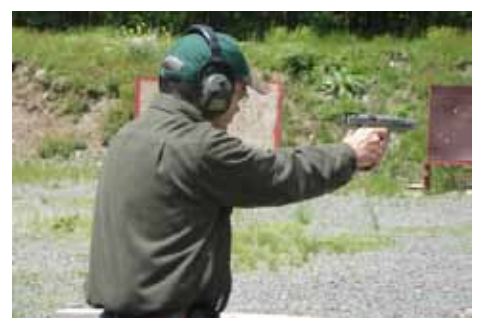
...with the pistol