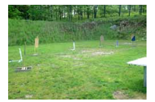
STAGE 6: MISSILE SILO

ou find empty missile silos meant to be kept secret. Engage T-1 thru T-4 with 2 rounds each