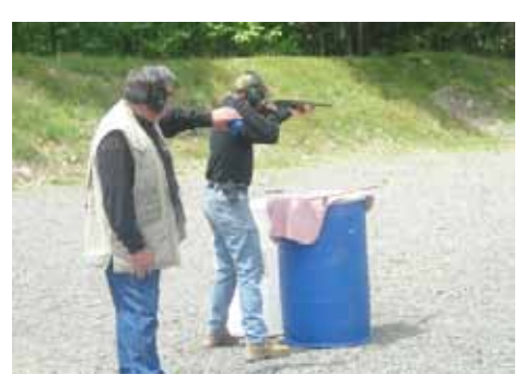
...with the shotgun