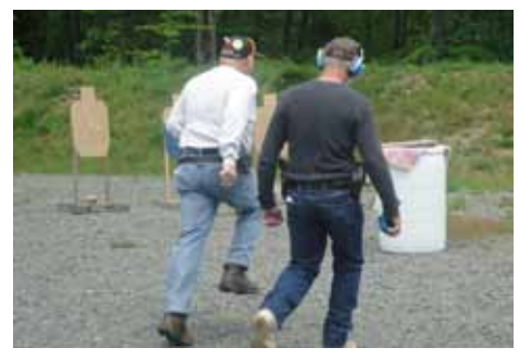
... then moves to final gun