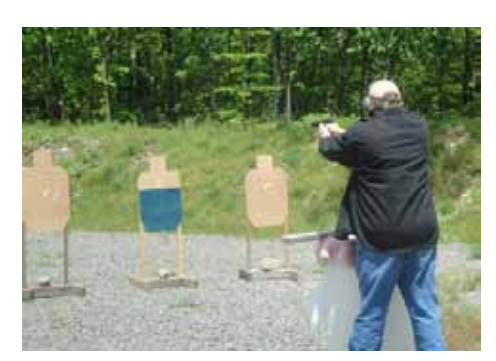
...then the pistol