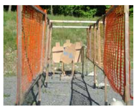
STAGE 2: SUBWAY TUNNEL Gang members want to kidnap your niece. Engage T-1 thru T-3 with 2 rounds each. Total of 6 rounds