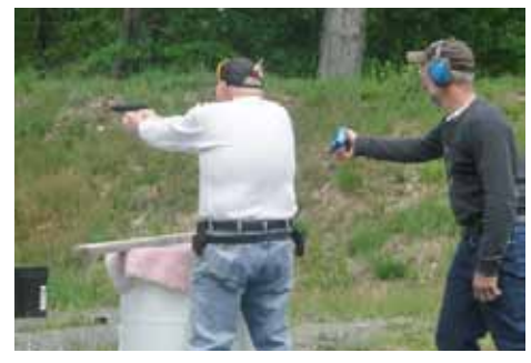
... and finishes with the pistol