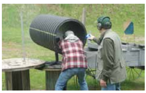
... the middle