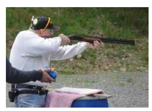
...with the shotgun