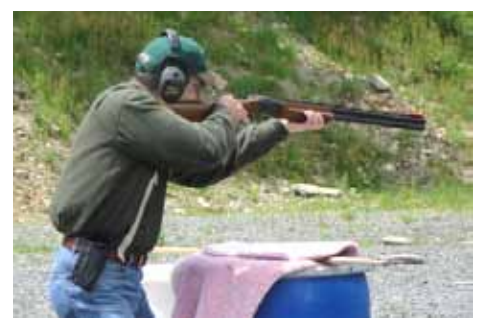
...with the shotgun