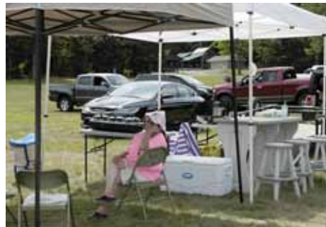
Holly got a chance to relax at the end of a hot day...