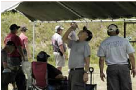
Shade and water were in demand

Thank you everyone for coming to the July action pistol match at the Matamoras Rod and Gun Club. We had a total of 51 shooters at the match this month which is a great turnout considering the heat. Of those 51 shooters, 48 finished the match and we had 3 DQs listed for scoring. For those who were DQ'ed from the match you are more than welcome to come back and shoot the matches in the future. A disqualification does not make you a bad or an unsafe shooter. They are part of the game and it can happen to anyone. Treat that experience as a learning experience and use it to better