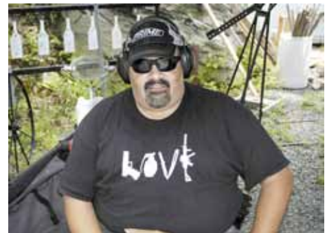
Love is all you need...