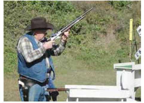
Nighthawk on Stage 4