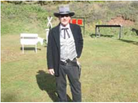
JW on Stage 4