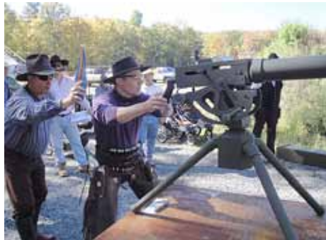
The Eastwood kid on Stage 5