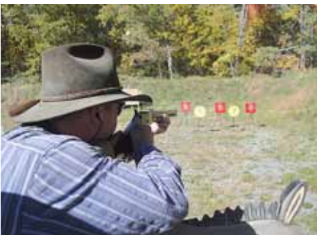
Chivato on Stage 2