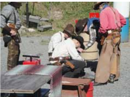
The maintenance crew fixing the swinger cable