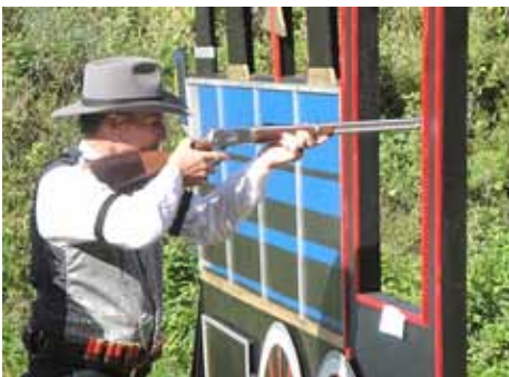
JW on Stage 4