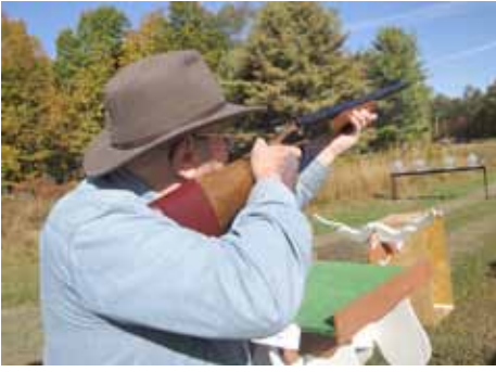
Vida-Loca on Stage 3