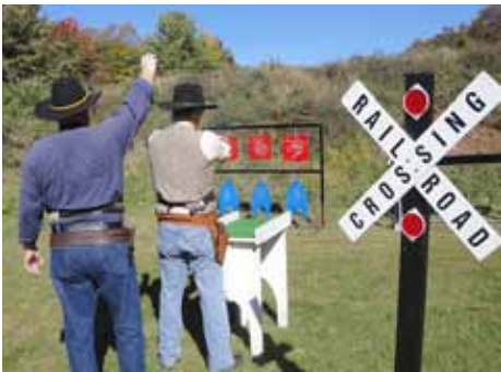
Rocket Shoes on Stage 4