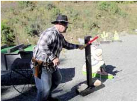
Freight Train on Stage 5