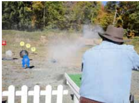
Vida-Loca on Stage 1