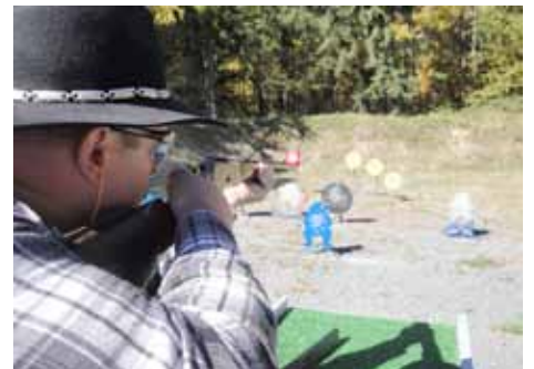
Freight Train on Stage 1