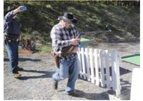
Freight Train Stage 1