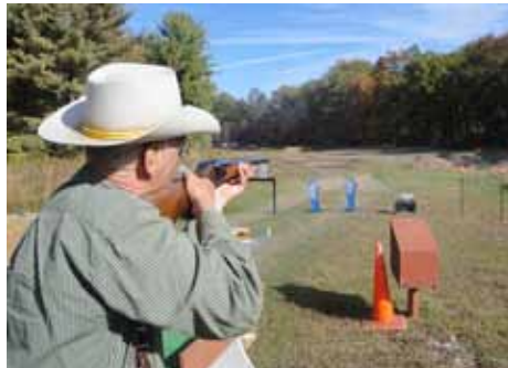
Peacemaker Reb on Stage 3