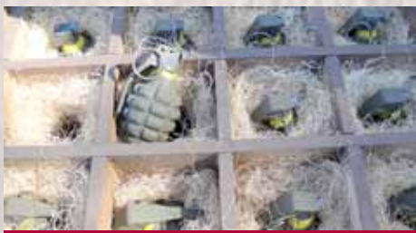
The grenade box on Stage 5