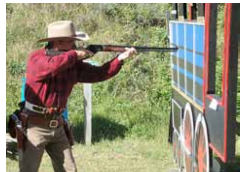
Mighty Quinn on Stage 4