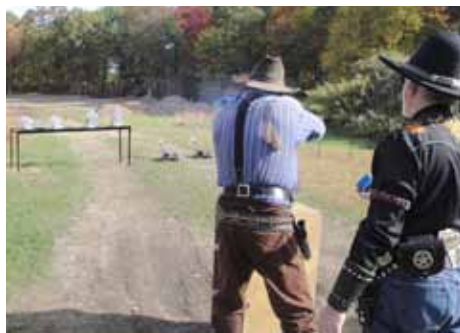
Chivato on Stage 3