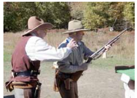
El Diablo Gringo on Stage 3