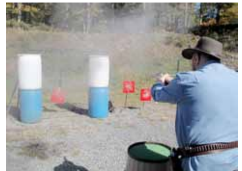
Vida-Loca on Stage 5