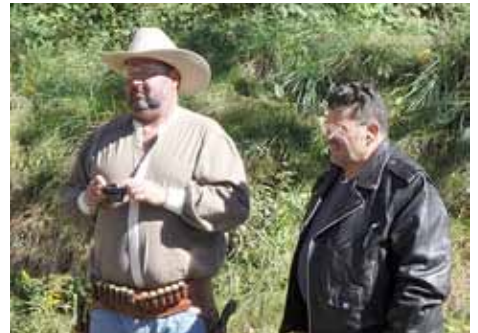
Dirtwater Dawg and Keeper of the Red Tail