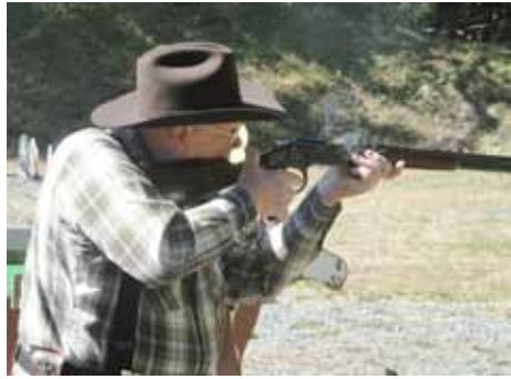
Nighthawk on Stage 2