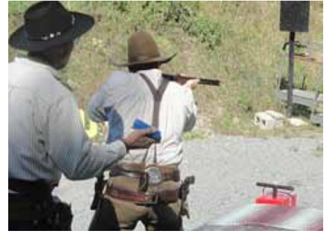
Pike on Stage 5