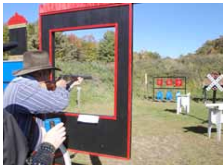
Chivato on Stage 4