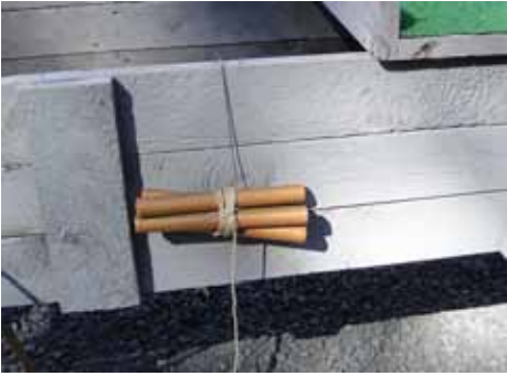
The dynamite sticks ready to explode