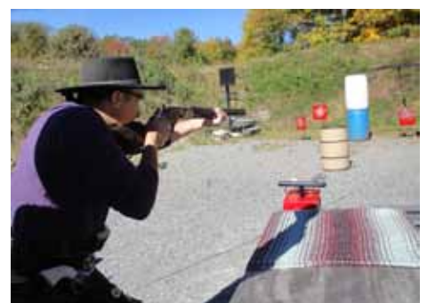
The Eastwood Kid on Stage 5