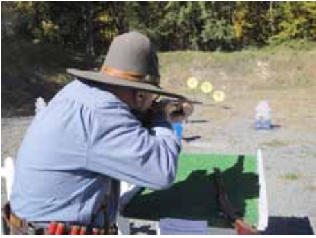
Pecos Pav on Stage 1