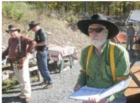
I.C. Moose on Stage 5