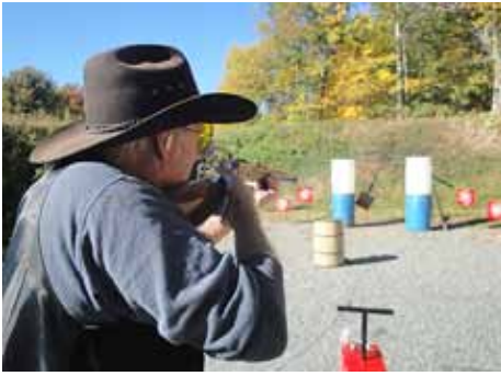
Moss on Stage 5