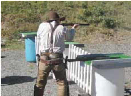
Pike on Stage 1