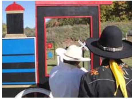
Newt Call on Stage 4