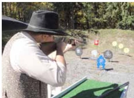
Rocket Shoes on Stage 1