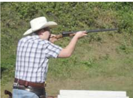
Joe Dirt on Stage 4