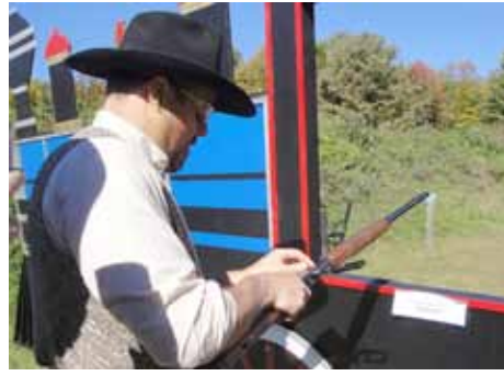
Rocket Shoes reloads on Stage 4