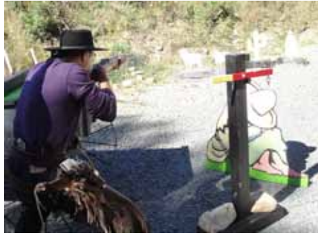
The Eastwood Kid on Stage 5