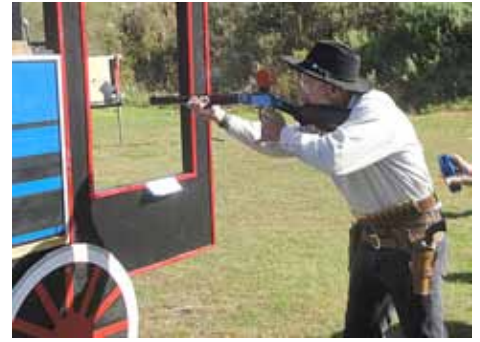
Hammerin Steel on Stage 4