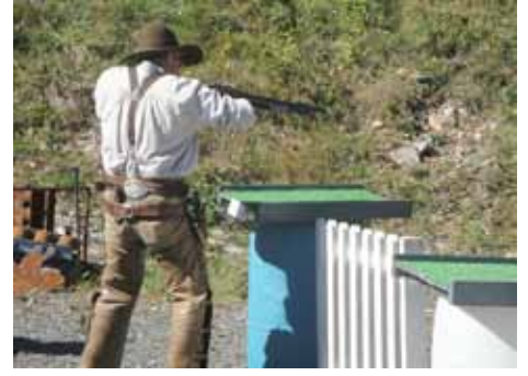
Pike on Stage 1