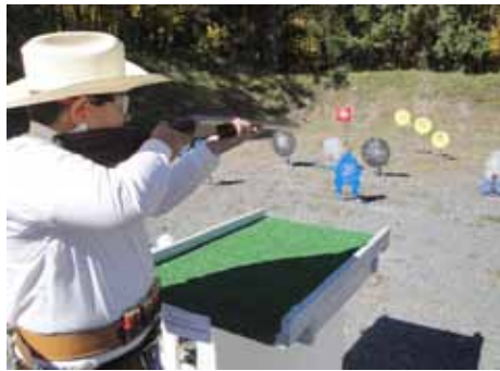
Newt Call on Stage 1