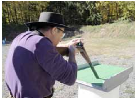
The Eastwood Kid on Stage 2