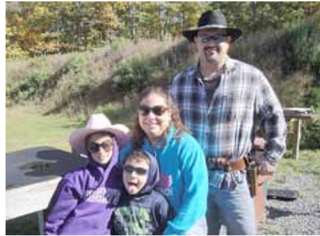
Freight Train and his train crew