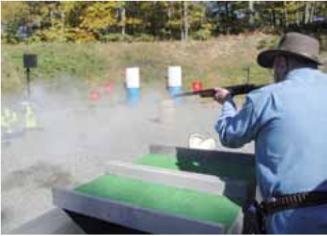
Vida-Loca on Stage 5