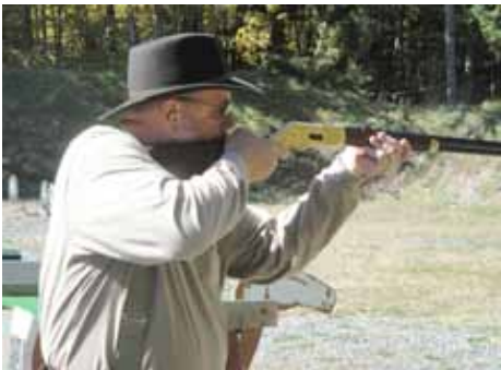
Steel Horse Cowboy on Stage 2