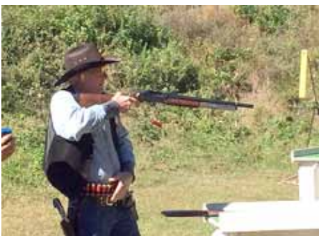
Moss on Stage 4