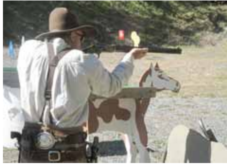
Pike on Stage 2