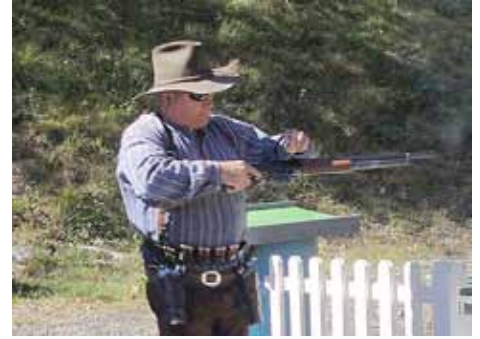
Chivato on Stage 1