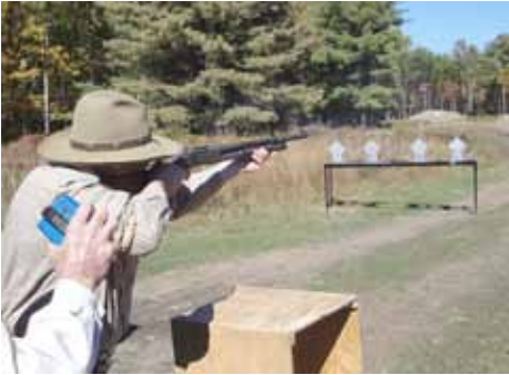
El Diablo Gringo on Stage 3