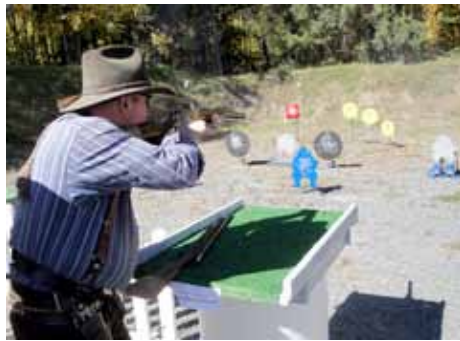
Chivato on Stage 1