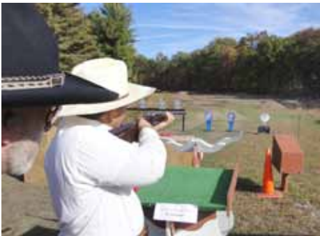
Newt Call on Stage 3