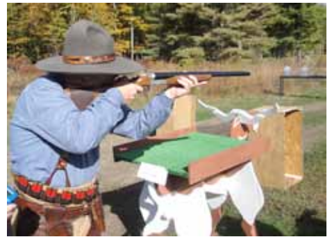
Pecos Pav on Stage 2