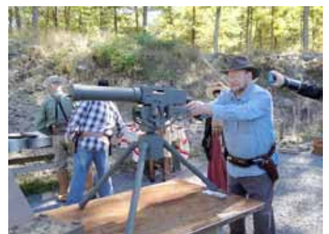
Vida-Loca on Stage 5