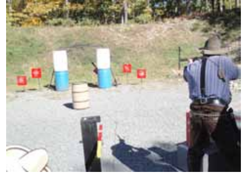
Chivato on Stage 5