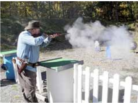
Vida-Loca on Stage 1