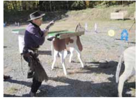
The Eastwood Kid on Stage 2