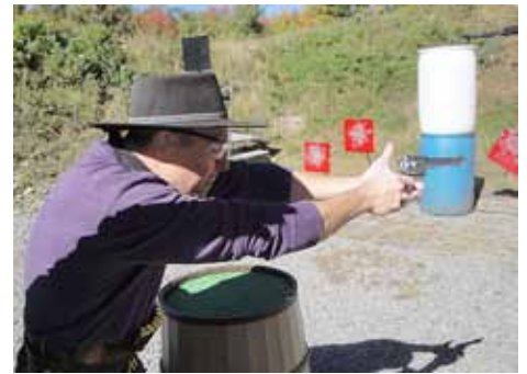
The Eastwood Kid on Stage 5