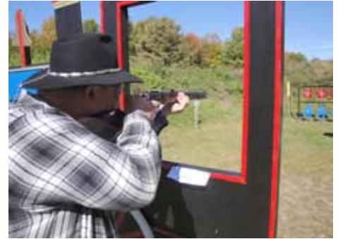
Freight Train on Stage 4