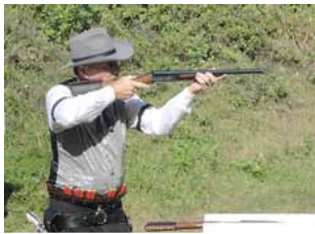
JW on Stage 4