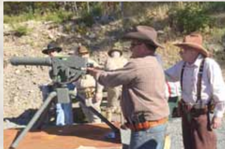
Chama Kid on Stage 5