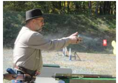
Steel Horse Cowboy on Stage 2