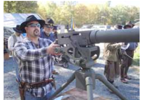
Freight Train on Stage 5