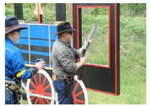
Badshot on Stage 4