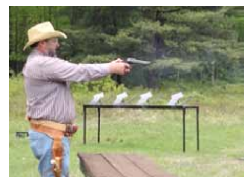
Dirtwater Dawg on Stage 3