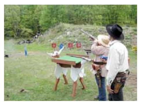
Sassy Southpaw on Stage 3