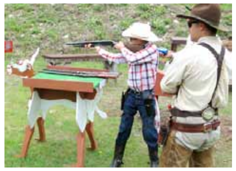
Bat Masterson on Stage 3