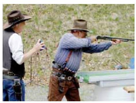
Chivato on Stage 1