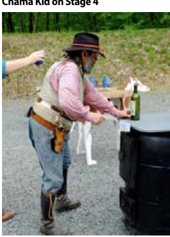
The Major says it ain't "Southern Comfort"