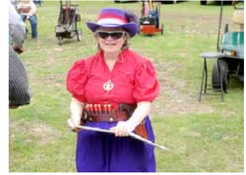
The very colorful Esmeralda