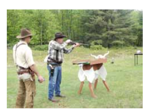
Nighthawk on Stage 3