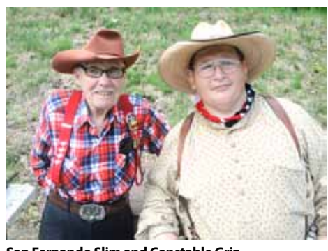
San Fernando Slim and Constable Griz