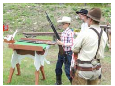
Bat Masterson on Stage 3