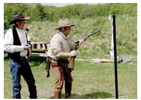
El Diablo Gringo on Stage 4