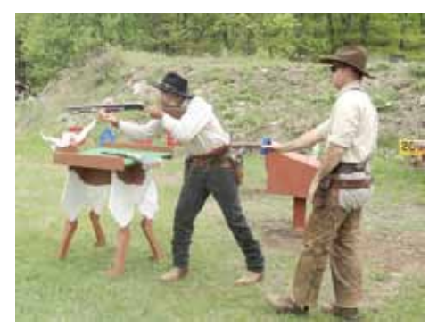
Hammerin Steel on Stage 3