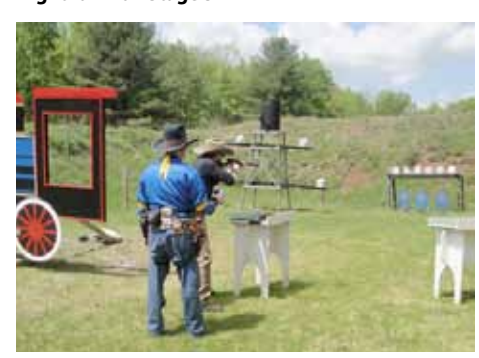
Mighty Quinn on Stage 4