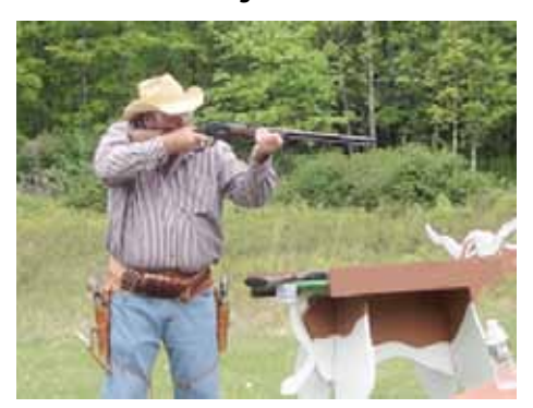
Dirtwater Dawg on Stage 3