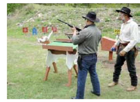
Badshot on Stage 3