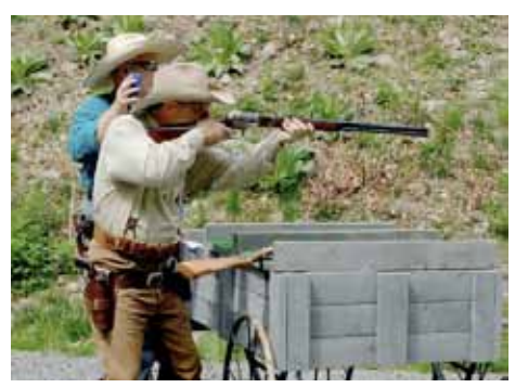
Stormy Roads on Stage 5