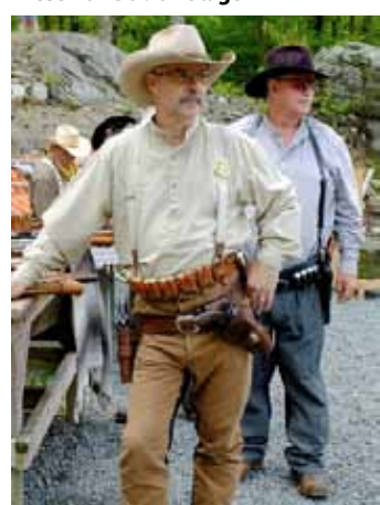
Stormy Roads and Buffalo Bob