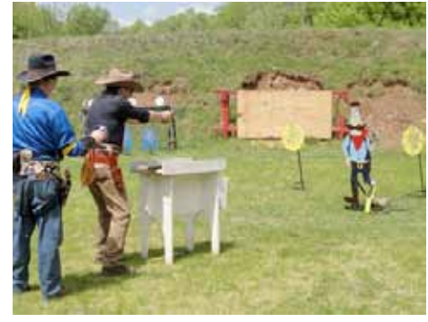
Mighty Quinn on Stage 4