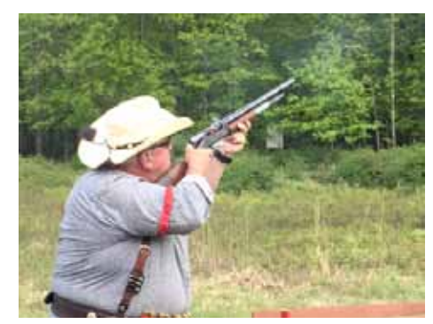
Dirty Dingus Diggs on Stage 3