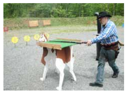
Dry Gulcher on Stage 1