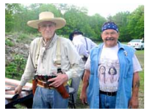
Old Campaigner and Keeper Of The Red Tail