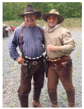
Chivato and El Diablo Gringo