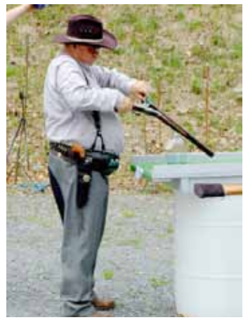
Buffalo Bob on Stage 1