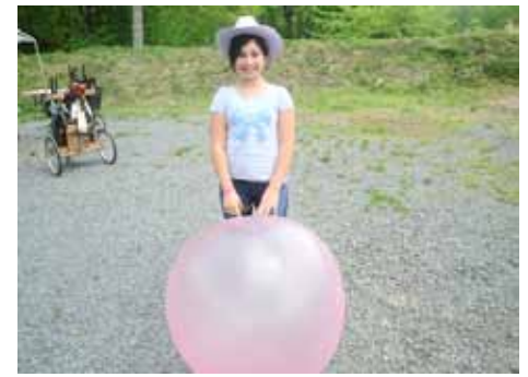
Abbey holds a possible bonus target. We would only need a few volunteers to inflate them.