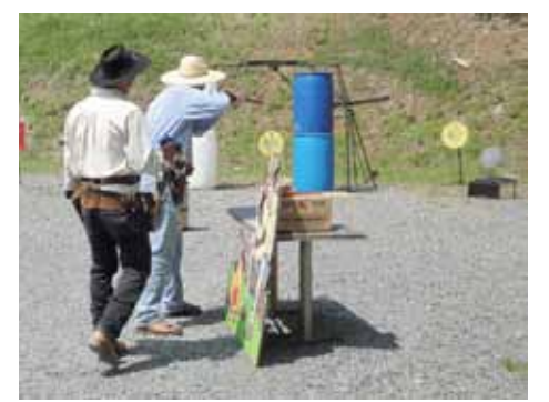
I.C. Moose on Stage 5