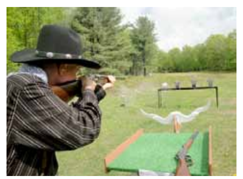
Dakota Deserter on Stage 3