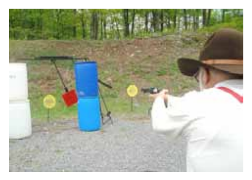
Grumpy Gramps on Stage 5