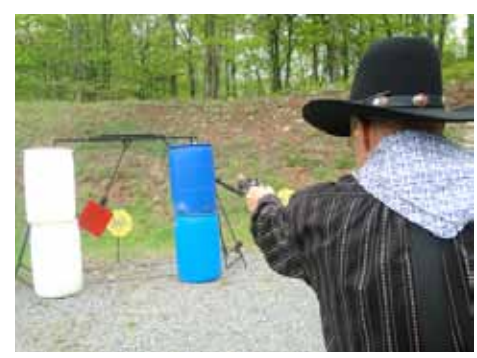
Dakota Deserter on Stage 5