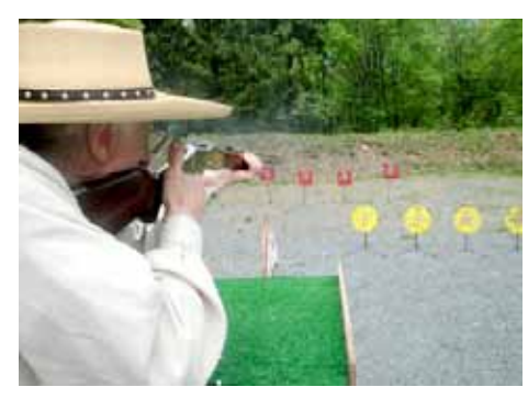
Old Campaigner on Stage 1