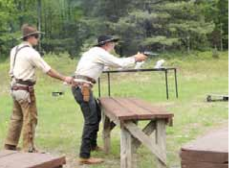
Hammerin Steel on Stage 3