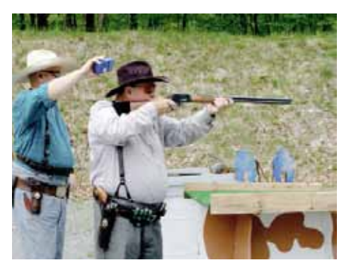
Buffalo Bob on Stage 1