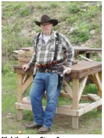
Nighthawk on Stage 5