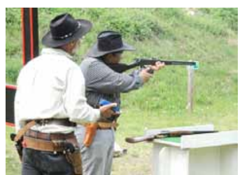
Quad Chester on Stage 4