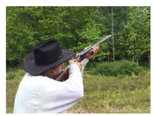
Ziggady Zag on Stage 3