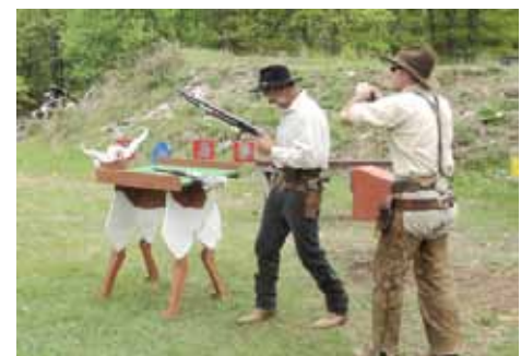
Hammerin Steel on Stage 3