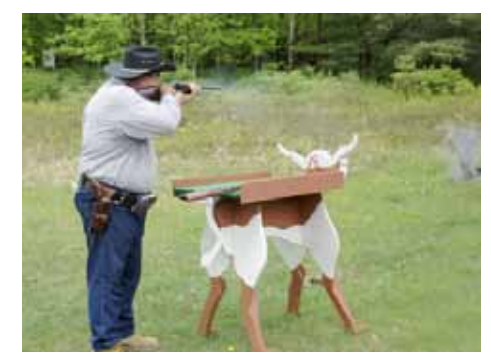
El Whappo on Stage 3