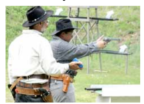
Quad Chester on Stage 4