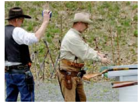
Stormy Roads on Stage 3