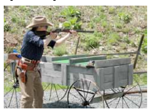
Mighty Quinn on Stage 5