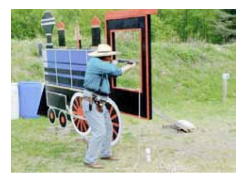
Abe The Crippler on Stage 4