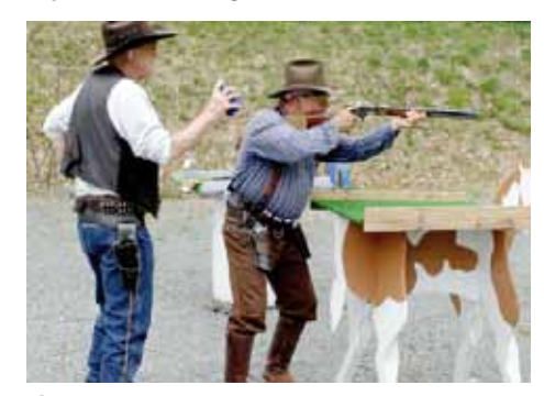
Chivato on Stage 1