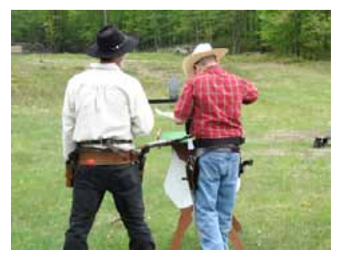
Joe Dirt on Stage 3