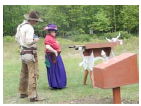
Pike tells Esmeralda she just stepped in a cow pattie.