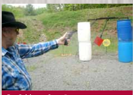
Dry Gulcher on Stage 5