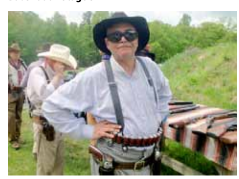
Kid From Brooklyn on Stage 4