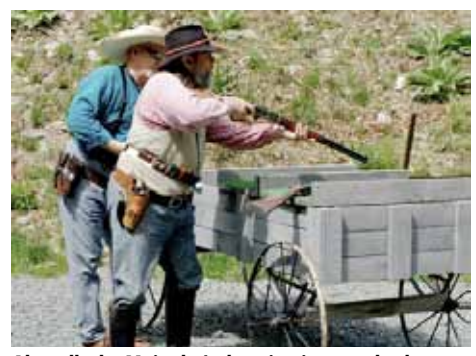
Abe tells the Major he's shooting in a southerly direction