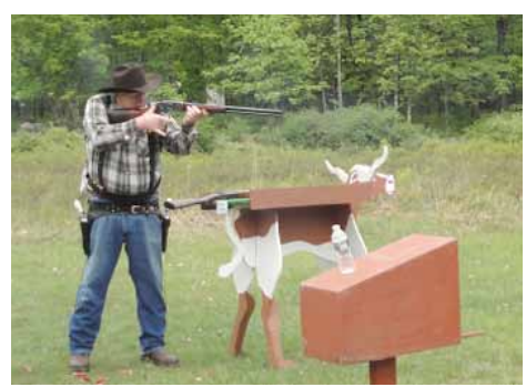
Nighthawk on Stage 3