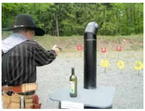
Dakota Deserter on Stage 1