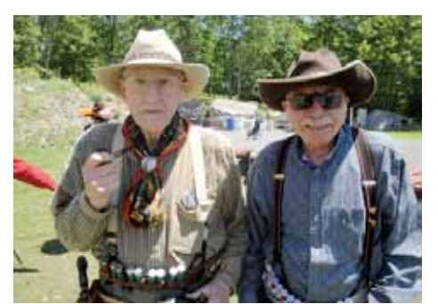
Old Campaigner and Black Jack Ed