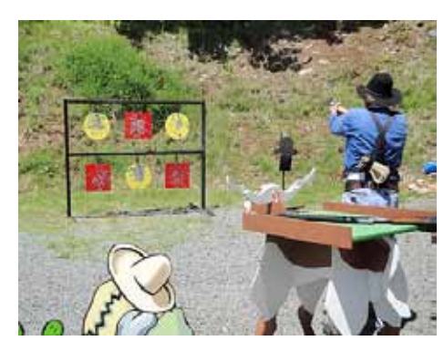
The Kid From Brooklyn on Stage 5