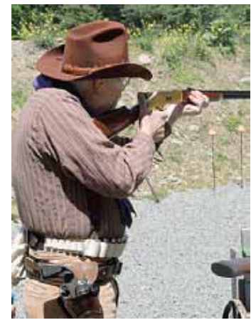
Grumpy Mitt on Stage 5