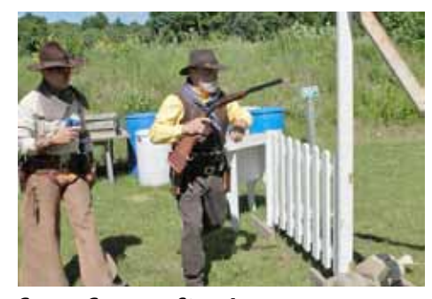
Grumpy Gramps on Stage 4