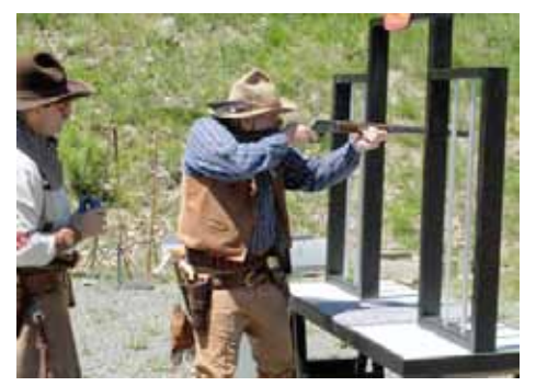
Crazy Crow on Stage 1