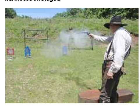
Lead Poison on Stage 4