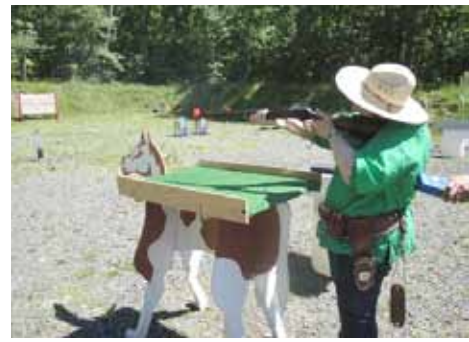
Sassy Southpaw on Stage 2