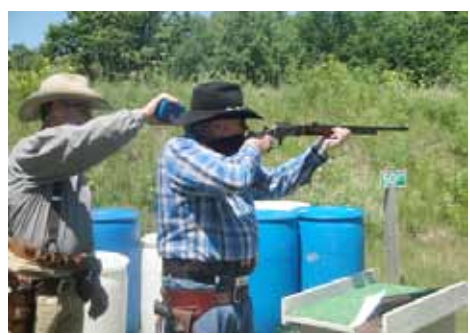
Dry Gulcher on Stage 4