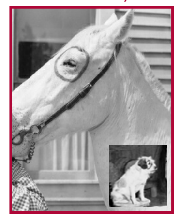
Email me with the answer if you know.

By the way, there was a dog in a 1952 western movie that had the same name as the horse.