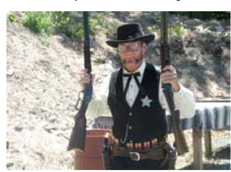
JW says he's the new sheriff in town