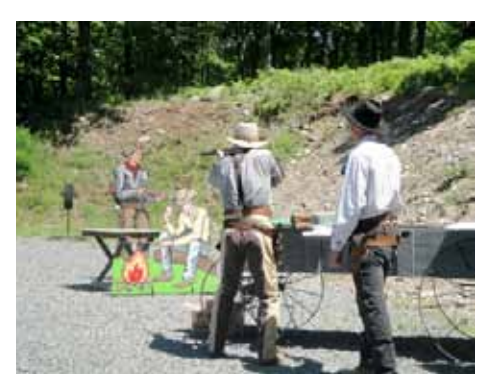
Stormy Roads on Stage 5