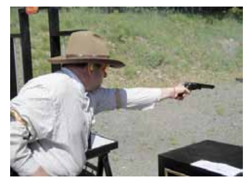
El Diablo Gringo on Stage 1