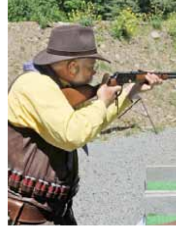
Grumpy Gramps on Stage 5