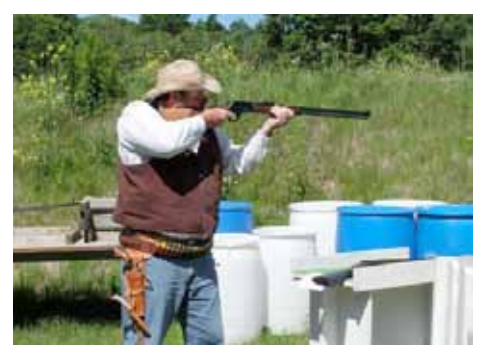
Dirtwater Dawg on Stage 4