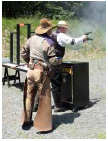
Cemetery on Stage 1