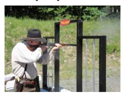
Lead Poison on Stage 1