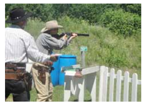
Stormy Roads on Stage 4