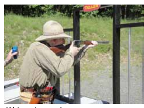
Old Campaigner on Stage 1