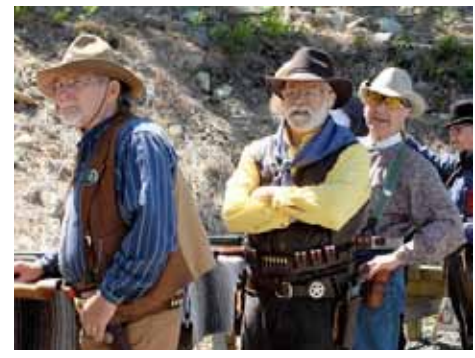
Crazy Crow, Grumpy Gramps and Latigo Means