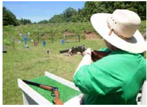
Sassy Southpaw on Stage 4