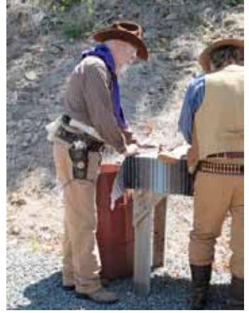
Grumpy Mitt checks Crazy Crow