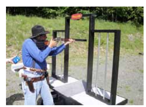
The Kid From Brooklyn on Stage 1