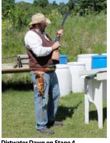
Dirtwater Dawg on Stage 4