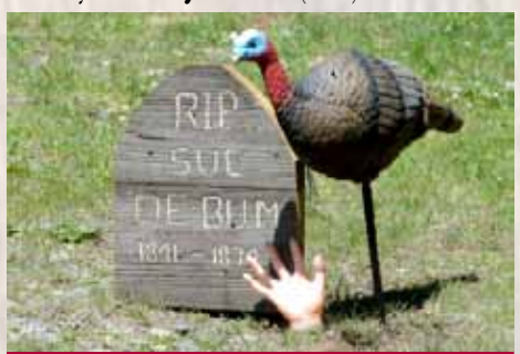
The turkeys that took over the cemetery at Stage 4 were soon dispatched by hired gunmen

The 50/50 drawing this month was won by Stormy Roads ($85).