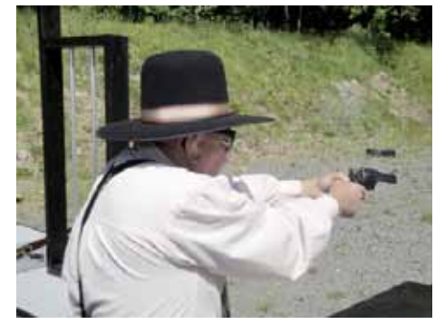
Turkey Creek Vic on Stage 1