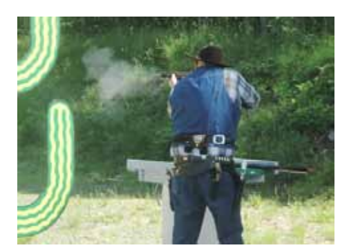
Nighthawk on Stage 3