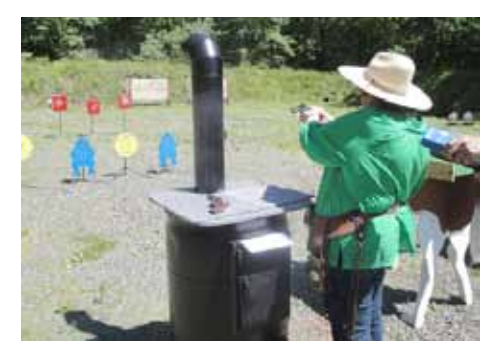
Sassy Southpaw on Stage 2