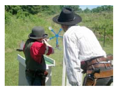
Deguello Will on Stage 4