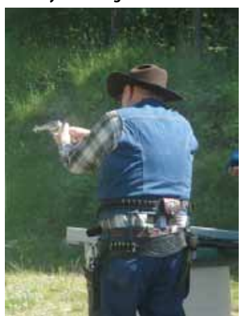
Nighthawk on Stage 3