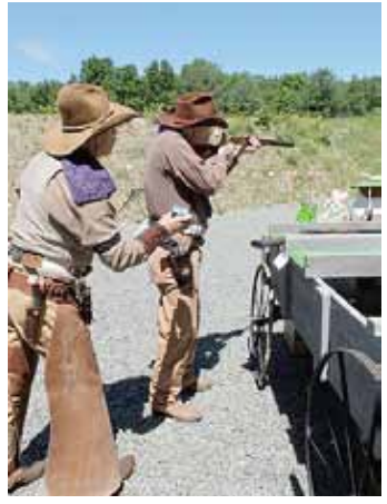
Grumpy Mitt on Stage 5