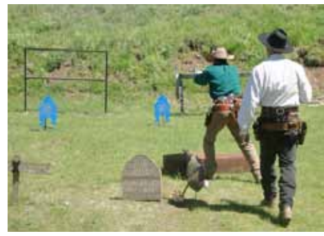
Mighty Quinn on Stage 4