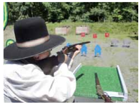
Turkey Creek Vic on Stage 3