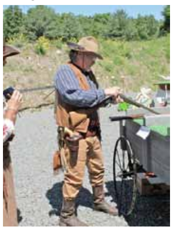
Crazy Crow on Stage 5