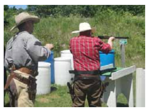
Joe Dirt on Stage 4