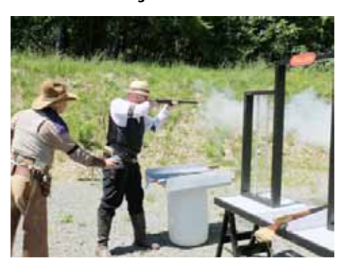
Cemetery on Stage 1