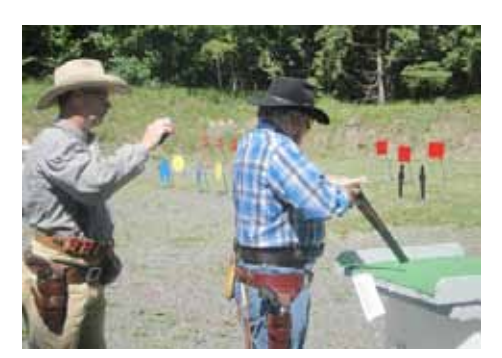
Dry Gulcher on Stage 3