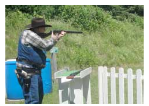
Nighthawk on Stage 4