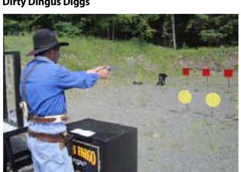
The Kid From Brooklyn on Stage 1