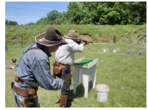
El Diablo Gringo on Stage 4