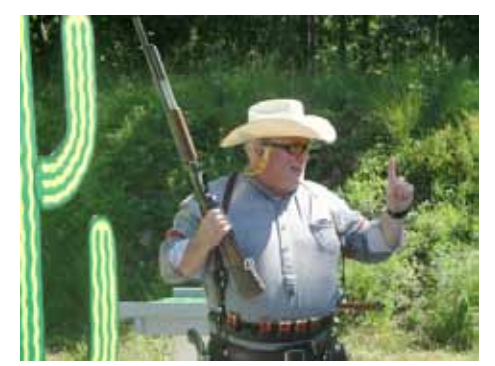
Dirty Dingus Diggs