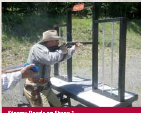
Stormy Roads on Stage 1

came in third. Congratulations to all who won their categories.