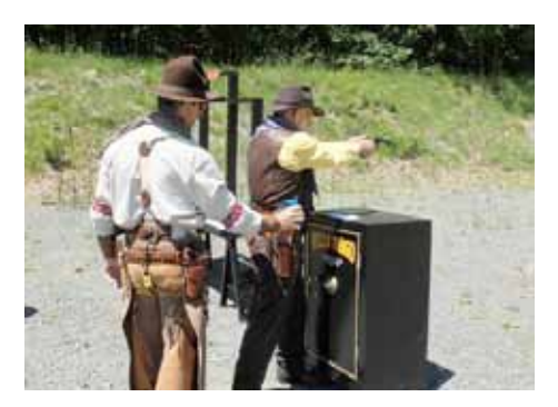
Grumpy Gramps on Stage 1