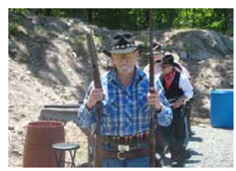
Dry Gulcher ready to shoot on Stage 5