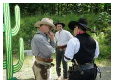
The Marshal ask Stormy.."So how do you shoot so fast?"