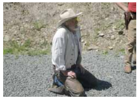
Moss pleads for younger brass pickers