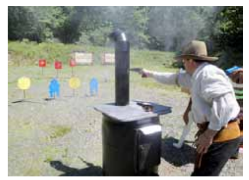
El Diablo Gringo on Stage 2