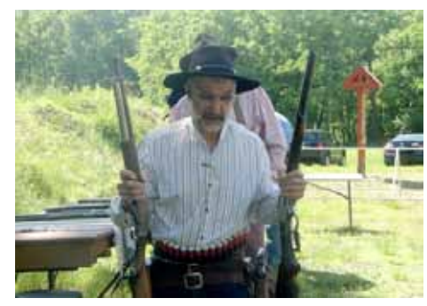
It's Hammer time!