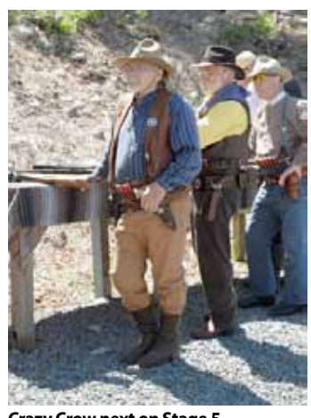
Crazy Crow next on Stage 5