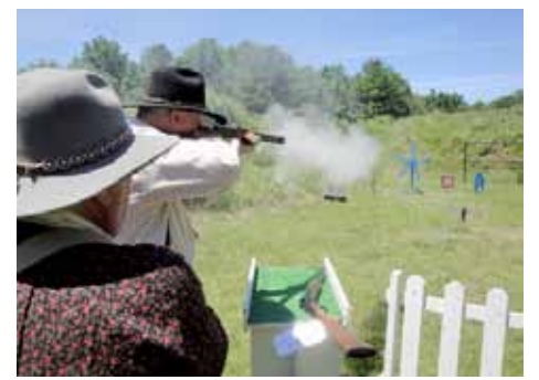
Lead Poison on Stage 4