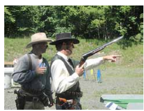
JW says the buffalo target is moving on Stage 3