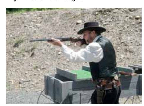
JW on Stage 5