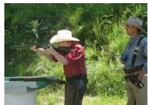
Joe Dirt on Stage 3