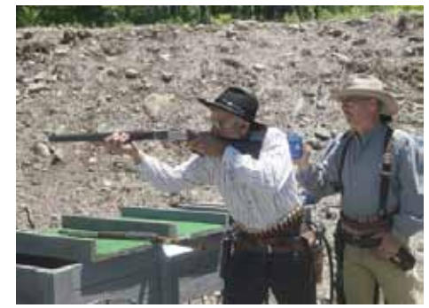
Hammerin Steel on Stage 5