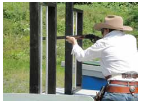
Mighty Quinn on Stage 2