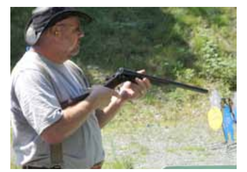
Steel Horse Cowboy on Stage 1