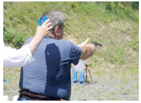
El Whappo on Stage 1