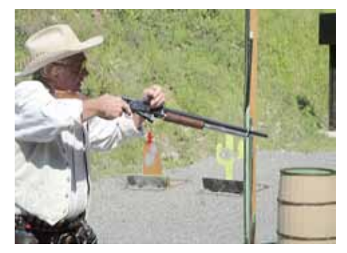
Moss on Stage 5