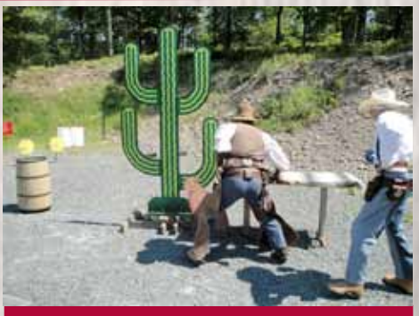
Travis Spencer on Stage 5

dial it back a little, maybe two shots on it, let us know.