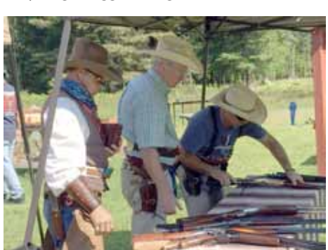
They think a mouse crawled into the rifle