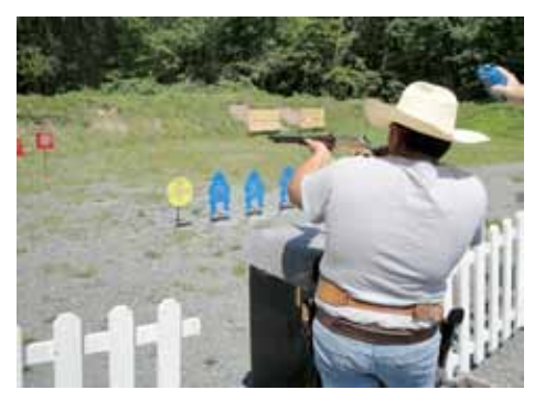
Newt Call on Stage 1