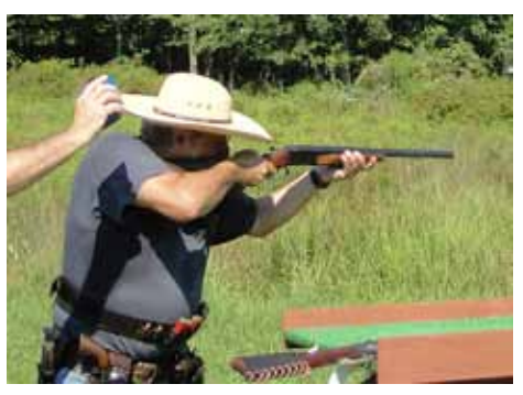
Ziggady Zag on Stage 3