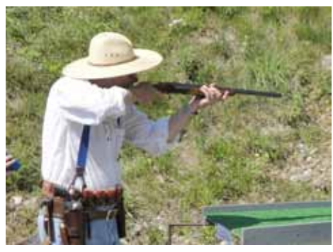
I.C. Moose on Stage 5