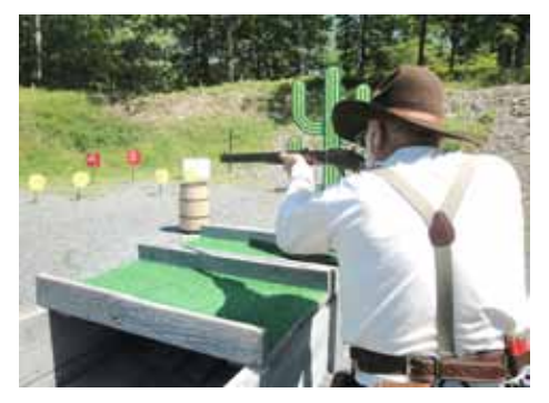
Grumpy Gramps on Stage 5