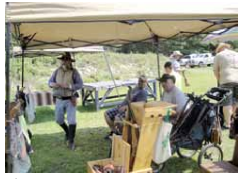
Taking cover on Stage 3