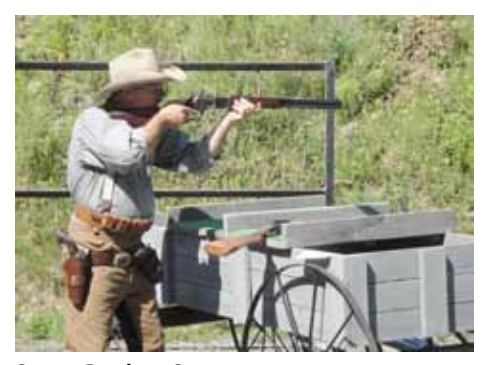
Stormy Roads on Stage 5