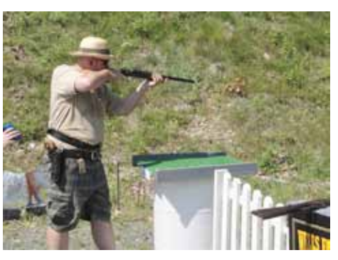
Cemetery on Stage 1