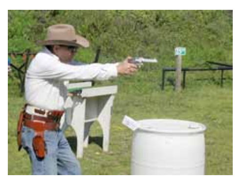
Mighty Quinn on Stage 5