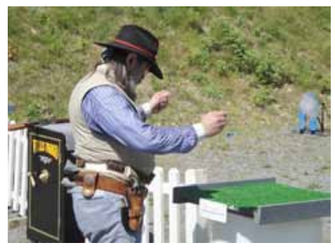
The Major performs the "hava nagila"