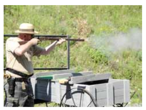
Cemetery on Stage 5