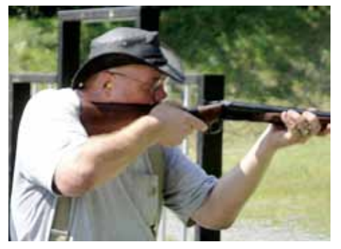
Steel Horse Cowboy on Stage 2