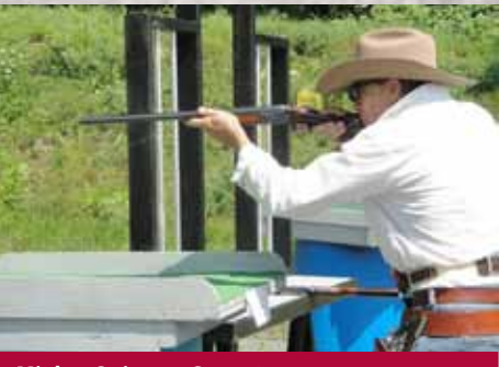
Mighty Quinn on Stage 2