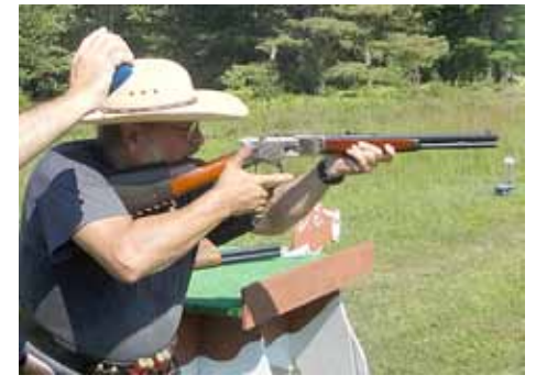
Ziggady Zag on Stage 3