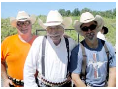
Dingus, Black Jack and the Marshal