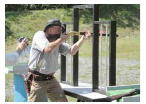
Steel Horse Cowboy on Stage 2