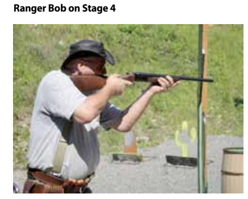
Steel Horse Cowboy on Stage 5