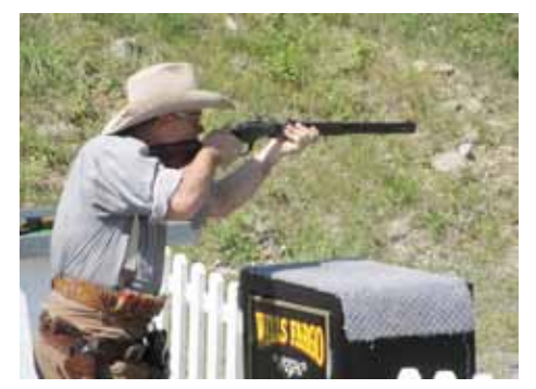
Stormy Roads on Stage 1