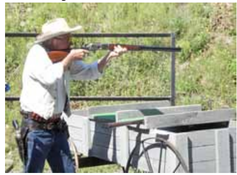
Moss on Stage 5