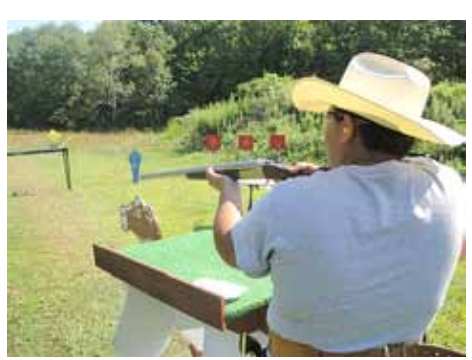
Newt Call on Stage 3