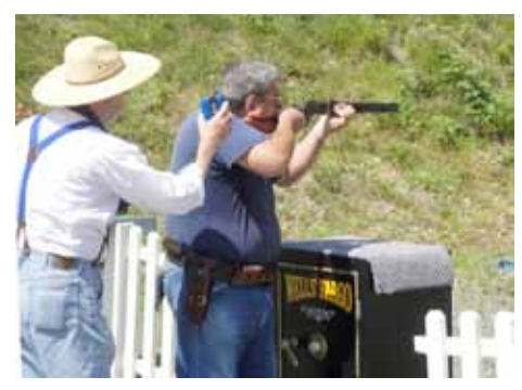
El Whappo on Stage 1