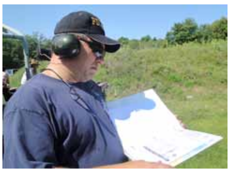
Lenny scores for Posse 2