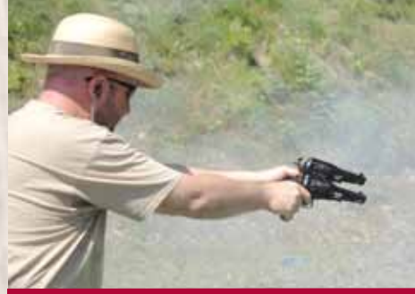
Cemetery shoots Front. Cart. Gunfighter on Stage 1

Stage 5 with the "running man" mover did provide a challenge though. It looks like only about 10 to 12 shooters were able the triple tap it before it hid behind the barrels. If this is the type of challenge you like, we'd like to get some feedback. Or if we need to