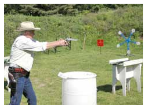
Moss on Stage 4