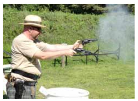
Cemetery on Stage 4