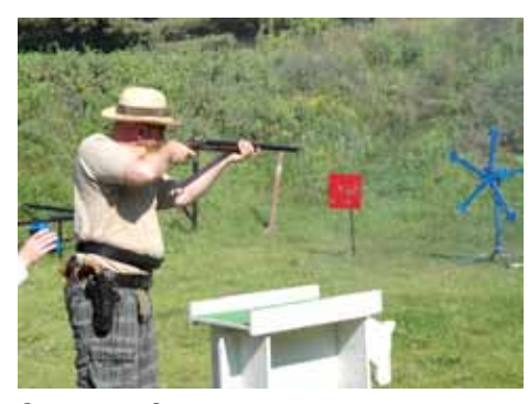
Cemetery on Stage 4