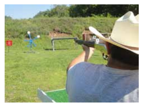
Newt Call on Stage 4