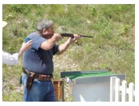
El Whappo on Stage 1