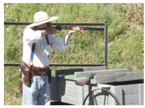
I.C. Moose on Stage 5