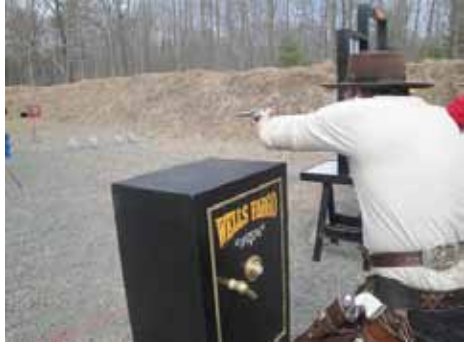
The Eastwood Kid on Stage 3