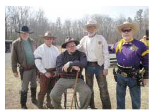
The return of The Magnificent 5