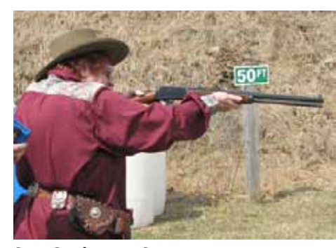
Sassy Southpaw on Stage 4