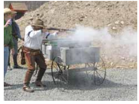
El Diablo Gringo on Stage 5