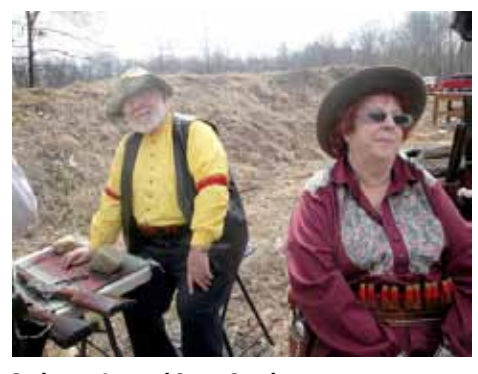
Scalawag Joe and Sassy Southpaw