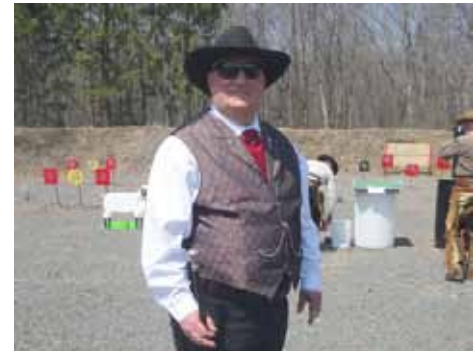
Hudson Ranger looking debonair