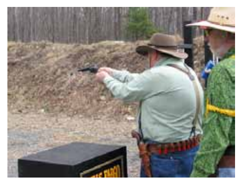
Cactus Coz on Stage 3