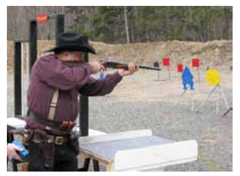
Ziggady Zag on Stage 3