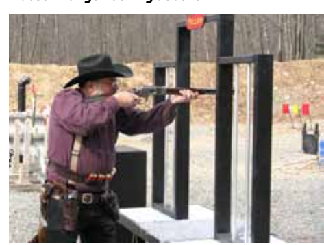
Ziggady Zag on Stage 3