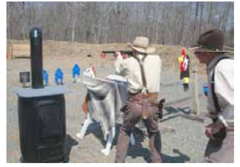
Stormy Roads on Stage 2