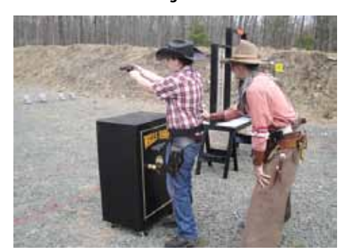
Joe Dirt on Stage 3