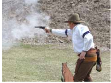
El Diablo Gringo on Stage 4