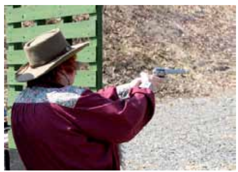
Sassy Southpaw on Stage 1