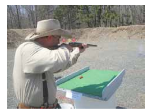
Stormy Roads on Stage 2