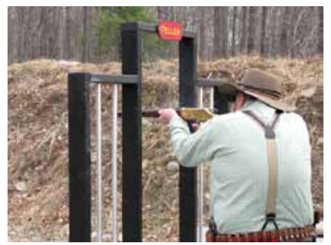
Cactus Coz on Stage 3