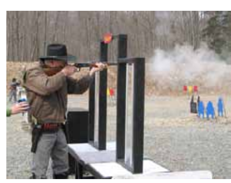
Lead Poison on Stage 3