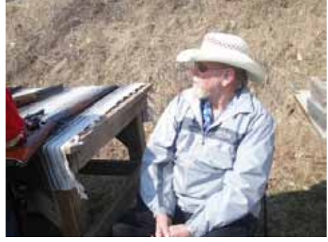
Dry Gulcher visited to just help out