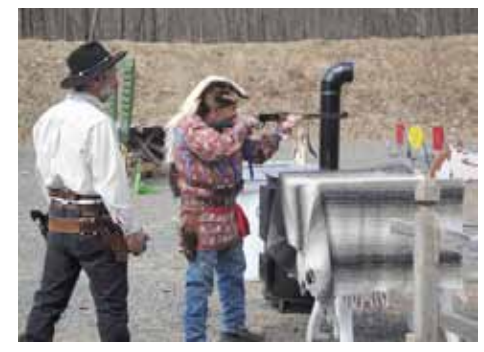
Red Tail on Stage 2