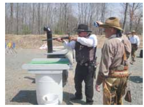
Hudson Ranger on Stage 2