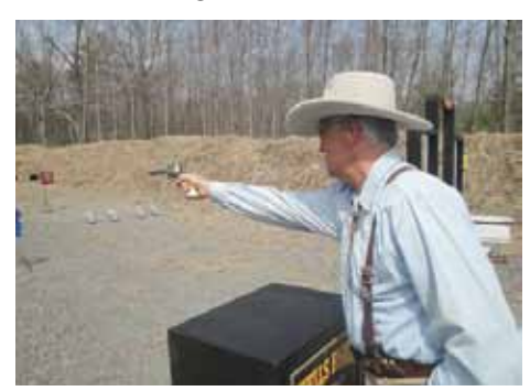
Peacemaker Reb on Stage 3