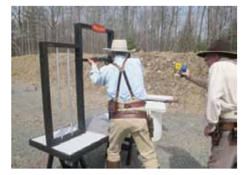
Peacemaker Reb on Stage 3