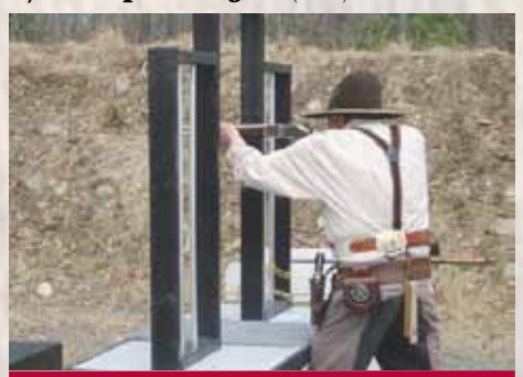
Black Jack Ed has trouble getting cash on Stage 4

The 50/50 drawing this month was won by Blackpowder Jim ($89).