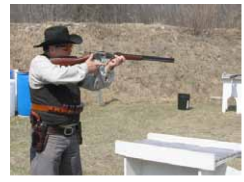
Chama Kid on Stage 4