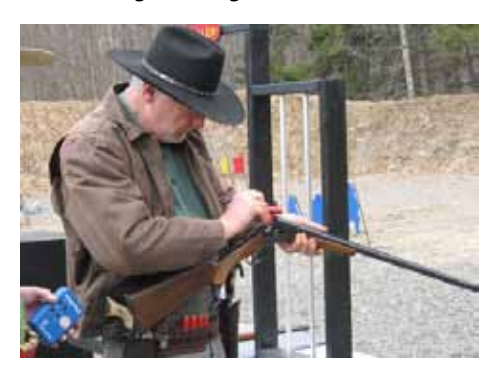
Lead Poison on Stage 3