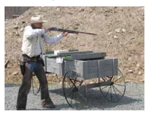
Moss on Stage 5