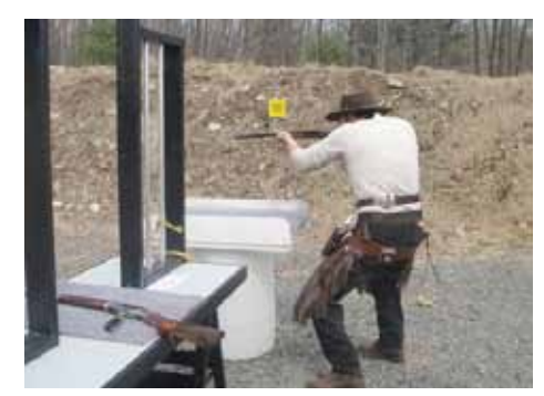
The Eastwood Kid on Stage 3