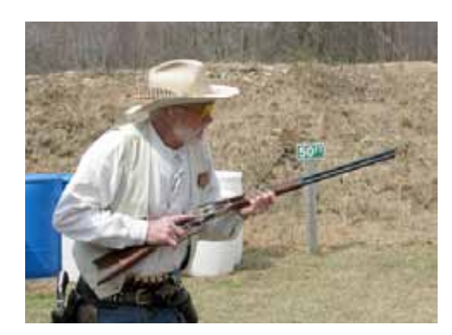
Moss on Stage 4