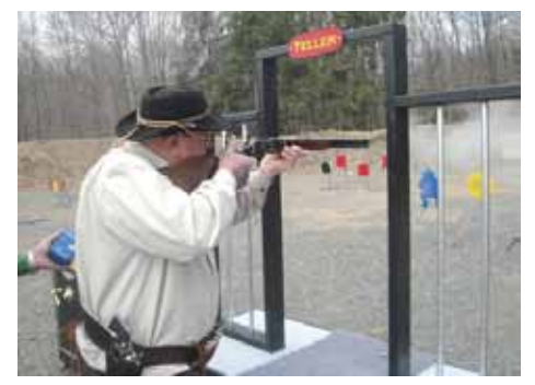
Vida-Loca on Stage 3